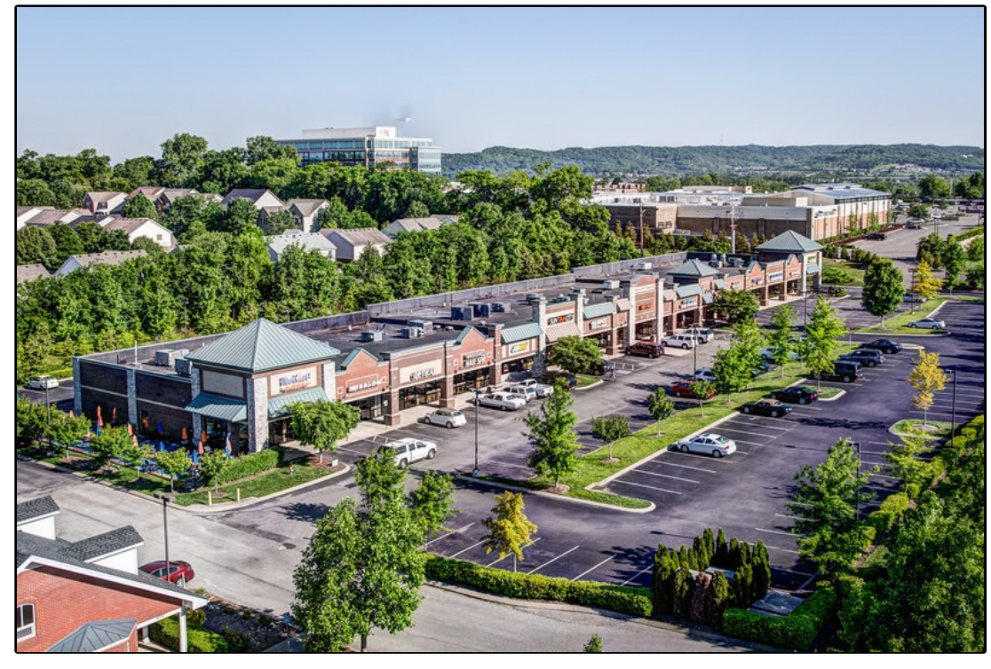
The information contained herein was obtained from sources we consider reliable. We cannot be responsible, however, for errors omissions, prior sales, withdrawal from the market or change in price. Seller and broker make no representation as to the environmental condition of the property and recommend purchaser's independent investigation.